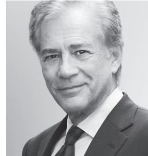
Prof. Dr. Fredmund Malik

In 2011, his classic of management literature Managing Performing Living was selected as one of the 100 best business books of all time The 100 best business books of all time. All you have to know. Murmann publishing house, 2011