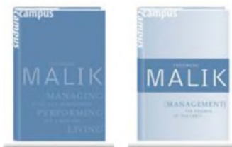
«Managing, Performing, Living – Effective Management for a New Era»

In addition, participants of the e-learning program receive Prof. Dr. Fredmund Malik's books «Management – the Essence of the Craft» and «Managing, Performing, Living – Effective Management for a New Era».